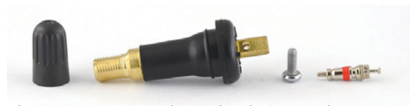
Alternate Option: 6-207A-1 (Bag 100). Valve Stem Rated at 68 psi.